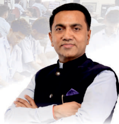
Dr. Pramod Sawant

Hon'ble Chief Minister & Hon'ble Minister for Skill Development & Entrepreneurship